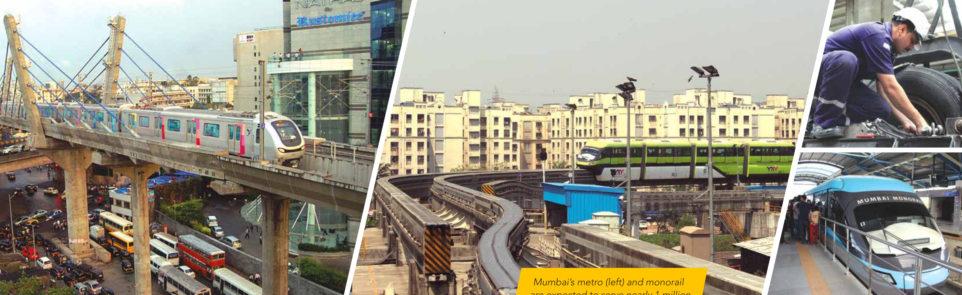
Mumbai's metro (left) and monorail are expected to serve nearly 1 million commuters per day within three years.

The Mumbai Metropolitan Region — comprising Mumbai, Navi Mumbai, Thane, Vasai-Virar, Bhiwandi and Panvel — boasts more than 21 million inhabitants, placing it among the 10 most populous urban areas in the world. Mumbai is the commercial center of India, accounting for more than 5 percent of gross domestic product. Mumbai also represents 40 percent of all international trade and more than 70 percent of all capital transactions. It also is the center of India's immensely popular Bollywood entertainment industry.